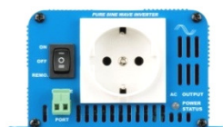
Phoenix Inverter 12/180 with Schuko socket