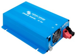
Phoenix Inverter 12 750

A unique feature of the SinusMax technology is very high start-up power. Conventional high frequency technology does not offer such extreme performance. Phoenix inverters, however, are well suited to power up difficult loads such as computers and low power electric tools.