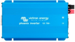
Phoenix Inverter 12 750