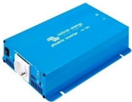
Phoenix Inverter 12 750 with Schuko socket