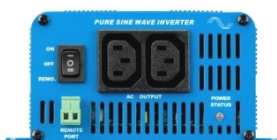
Phoenix Inverter 12/350 with IEC-320 sockets